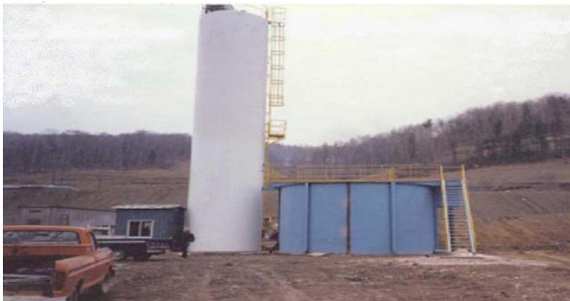
MINING—Water Treatment and pH Control