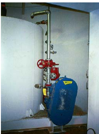
SLURRY TANK PUMP