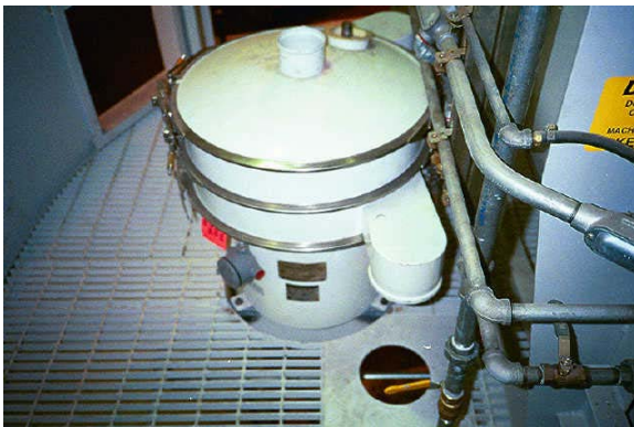
LIME SLURRY GRIT SCREEN