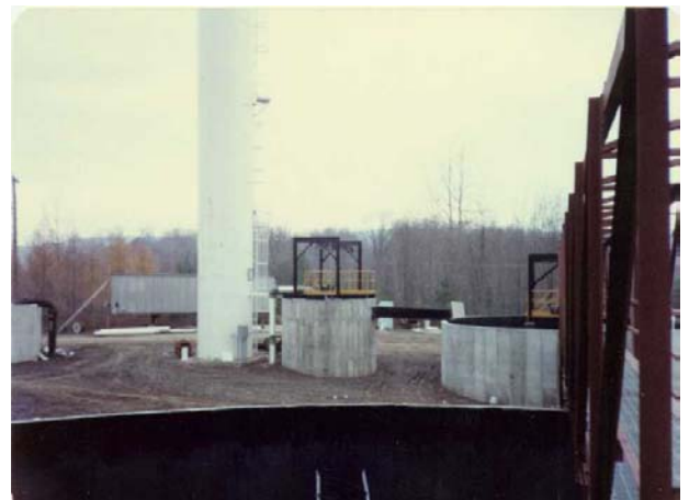
MUNICIPAL and INDUSTRIAL—Water Treatment