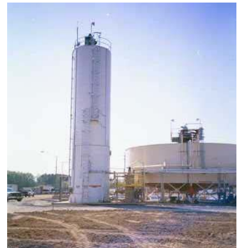
MINERAL— Acid Neutralization

SLOGAN SYSTEMS SLOGAN ENGINEERING COMPANY 300 MT. LEBANON BLVD. PITTSBURGH, PA. 15234 PHONE: 412- 563-3947 FAX: 412-563-3950