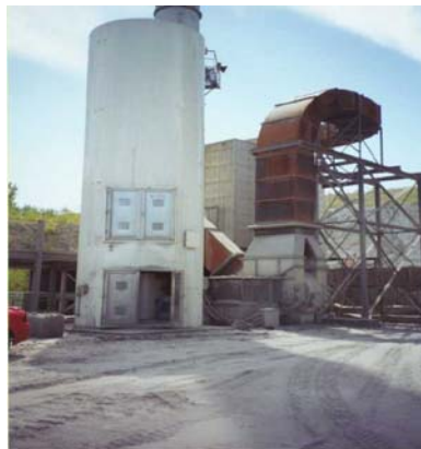
CHEMICAL—Air Pollution Control